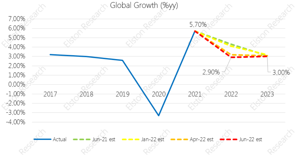
Fig.1. World Bank Global Growth downgrades

The World Bank has been steadily revising down its 2022 global growth estimates over the last 12 months. From +4.3%yy in June 2021, to +3.20% in April 2022 to +2.90% in June 2022.